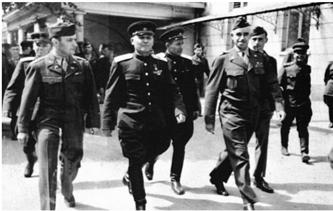
On that day, April 25, 1945 American and Russian soldiers met as comrades-in-arms, embraced each other, and exchanged buttons, stars and patches from each other's uniforms. Soviet Marshal Ivan Konev presented U.S. General Omar Bradley with his war horse, Bradley presented Konev with the Legion of Merit – and also gave him a jeep. Marshal Georgy Zhukov, the top Soviet general, awarded Supreme Allied Commander Dwight D. Eisenhower the highest honor of the Soviet Union, the Order of Victory. Eisenhower gave Zhukov the Legion of Honor.